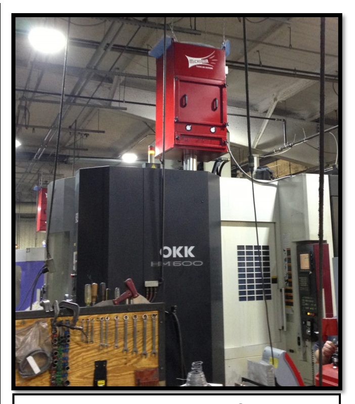
MM800 on Machining Center

tion MISTMAX™ filters will provide 1-5 year filter life in applications such as high-speed machining centers, heat treating, cold drawing, gear cutting etc., operations once deemed too tough for traditional methods of mist collection. Mist laden air flows through the inlet or inlets into the bottom plenum. The air then turns 90 degrees and goes upward through the exclusive Mist-X pre-separation filter where most of the oil is removed. Finally, the air goes through the 99.98% efficient MISTMAX™ filter. This special filter removes any remaining mist and smoke. Clean air is then discharged at the top of the unit. Oil, removed from the airstream, drains out the bottom of the plenum.