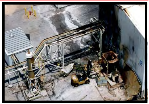
Conveyor Fire caused secondary explosion in this manufacturing facility.

In addition, the program emphasizes the need for prevention of dust clouds forming off of equipment such as grinders, mixers or other dust producing operations. Thus, the need for properly equipped dust collection is further mandated within the program.