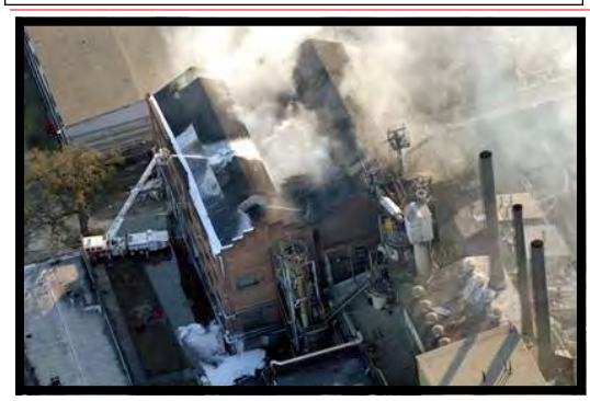
Explosion at Imperial Sugar in February 2008. (Port Wentworth, GA)

But, local inspectors have the leeway to also look at any other type of dust deemed to be a potential explosion hazard. OSHA inspectors are specifically looking for potential ignition sources and the accumulation of dust in the plant which could fuel a secondary, and usually more powerful blast. This could occur if