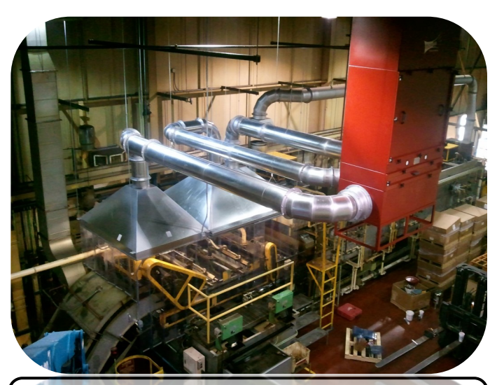
MM2400—Ceiling Hung Ducted to Hoods over Machining Process

filters remove any remaining mist and smoke. Clean air is then discharged at the top of the unit. Oil, removed from the airstream, drains out the bottom of the plenum.