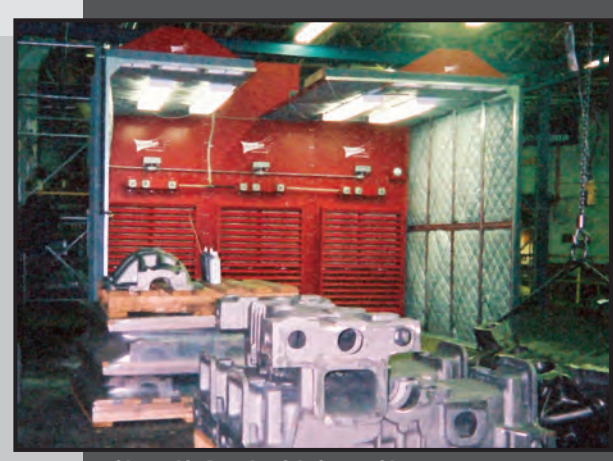
Clean Air Booth with Crane Slot