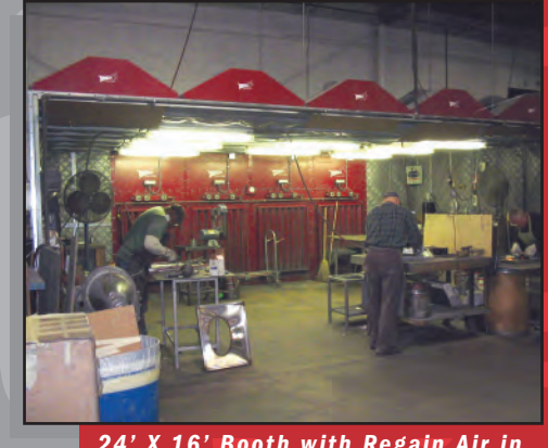
24' X 16' Booth with Regain Air in Grinding Work Cell

Sound levels within the booth are the lowest in the industry according to published test data. "Banging" associated with reverse pulse filter cleaning systems is eliminated, providing an improved working environment. With the "quiet cleaning power" Micro Air provides, there's no need to delay pulse cleaning until the workers have left the booth.