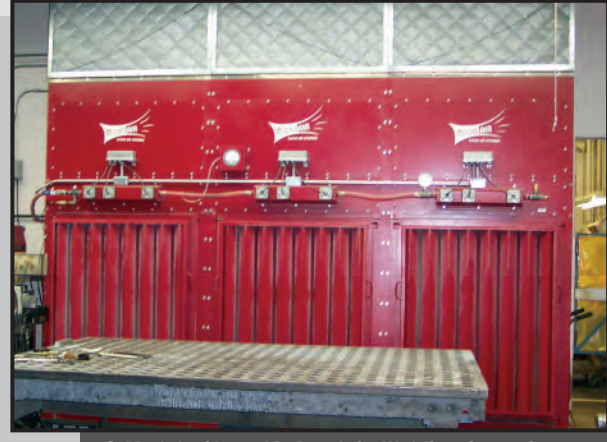
3-Module Clean Air Booth in Welding Operation