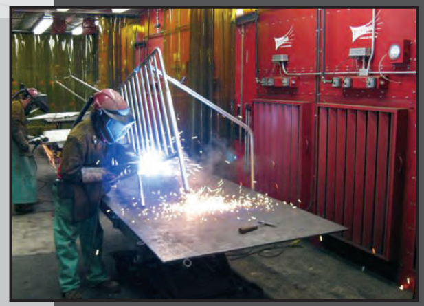
4-Module CAB Collects 99.99% of Hexavalent Chromium Contaminants Generated in Stainless Steel Welding Operation, Exceeding OSHA's Stringent New Standard for Cr(VI).